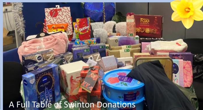
A Full Table of Swinton Donations

If you read our last Newsletter, you will be aware the effort our Swinton team put into making sure the Christmas appeal is a success, once again the team made an outstanding donation, from chocolates, bubble baths, shirts and sleepwear the team made sure there was something for everyone.